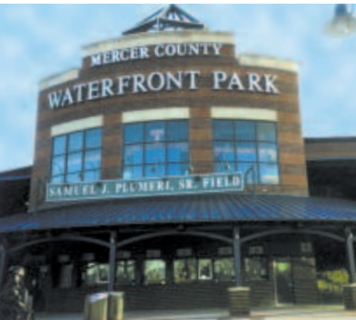
The Trenton Thunder minor league baseball team, a New York Yankees affiliate, plays at Waterfront Park.

The Ewing Public Schools are located in Ewing Township, Mercer County. Ewing is a progressive K-12, multicultural, suburban school district. The district's educational program is not only innovative, but also excels in a wide variety of scholastic, extra-curricular, and athletic areas. Some of the most recent awards earned by the school district include the following: National and State Principal of the Year; New Jersey Department of Education "Best Practices;" New Jersey School of Character; an award winning Robotics Team; Odyssey of the Mind World Finalists; and KidsBridge Humanitarian award winners. Our mission statement,