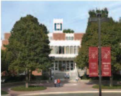
The region has an outstanding higher education profile, including Rider University (above), Princeton University, The College of New Jersey, and Rutgers University.

2565 Princeton Pike, Lawrenceville, NJ 08648 609-671-5440 • www.ltps.org Size: 4,000 students PK-3: Ben Franklin, Eldridge Park, Lawrenceville, and Slackwood Elementary Schools 4-6: Lawrence Intermediate School 7-8: Lawrence Middle School 9-12: Lawrence High School