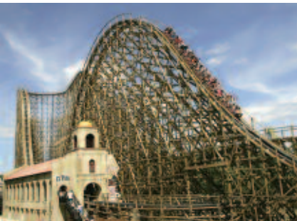
Six Flags Great Adventure in Jackson attracts families with its amusement park, water park, and drive-through safari and educational programs for schools.

The Jackson School District is committed to developing and sustaining a learning environment that fosters growth in scholarship, character, and initiative. Our comprehensive educational program provides opportunities for students to become lifelong learners and contributing citizens in a worldwide community. Outstanding educators embrace the philosophy of differentiated instruction and use creative tools, techniques, and approaches to make sure they are reaching every child. A strategic approach to evaluating and improving curriculum helps keep programs fresh and relevant, which allows us to provide a meaningful educational experience. To provide a well-rounded educational experience, we also are committed to offering a myriad of extra-curricular and athletic opportunities, in which our students excel. The Jackson School District staff is comprised of experienced and less experienced teachers and our pursuit of grants augments professional development opportunities for our entire educational team.