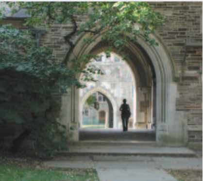
Princeton University serves as a center for teacher professional development along with other area colleges and universities.

Princeton, a central New Jersey community of 30,000, has grown beyond its traditional identification but has not outgrown its traditions. Princeton Regional Schools is a combination of Princeton Borough, Princeton Township, and Cranbury. The educational program in the primary grades focuses on developing higher-order thinking skills, cooperative learning, literature-based reading and writing processes, pre-school, early childhood education, Mathematics, Science applications, and a global perspective. The middle school program offers a smooth transition between the elementary level and the high school and includes: all core academic subjects, accelerated Mathematics and Music programs, Family Life, Industrial Arts, Art, World Languages, and Special Education. Princeton High School has a comprehensive program of studies that enables each student to pursue an instructional program that will prepare him/her for college, technical training, or employment.